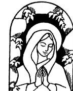
May, The month of Mary

SPECIAL DATES: First Communion at St. Thomas is on Sat., May 7th at 10:00 A.M. Confirmation at St. Michael’s College is on Thurs., May 19th at 7:00 P.M.